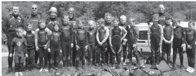
Above After a day's gorge-walking. Below Chippy Explorers with some new Scottish friends at the World Jamboreette

which decided which activities we would be doing in the morning and afternoon. We also did activities off-site including visiting a theme park and a biodiversity museum as well as a day out in Amsterdam – all exciting days out. Overall the Jamboreette was a great experience, mixing and making friends from all over the world and trying out new activities. It is definitely a once in a lifetime experience and we would recommend it to anyone who is interested.