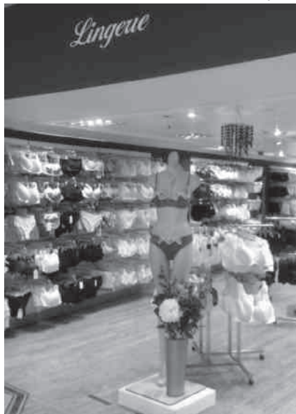
What Chippy lacks ... the lingerie dept in Beales of Worthing

Chipping Norton has an eclectic range of shops – but no one stocks basic ladies underwear. In a personal letter to the new owner of Beales,