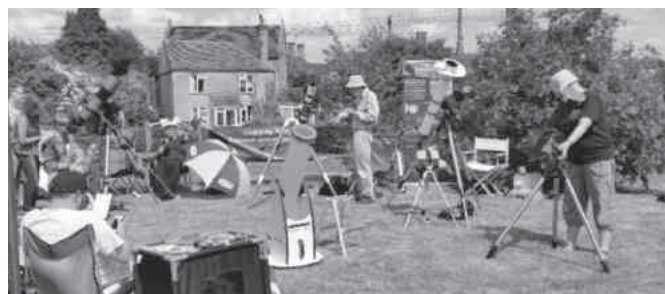
CNAAG members take the sun at Long Compton

Members of Chipping Norton Amateur Astronomy Group have been active over the summer with several late night observing meetings culminating in some spectacular Perseid meteor shower observations around 12 August – the astronomer's 'glorious twelfth'. Our diligent band of astrophotographers have been busy and their results can now be seen on our publically viewable Facebook site. Early morning observers, insomniacs and milkmen have already noted the eastern rising of the Pleiades star cluster, a sure reminder that the magnificent nights of autumn are not too far away. Father's Day found us at Wellesbourne Wings and Wheels where we were treated to a display of sheer power and elegance by the ground based Vulcan bomber followed by a jaw dropping, ear shattering flying display by the last flying Vulcan – a great privilege. Another sun-blessed Saturday in July found us at the annual Long Compton fete where the Sun and Venus in daylight, generated a lot of interest.