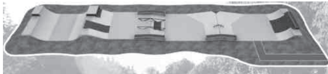
One of the possible designs on display

On Thursday 6 August a Town Hall exhibition was held to show Chipping Norton's current and would-be skateboarders three options being considered by the Town Council's Recreation Committee for a skateboard park at Greystones.