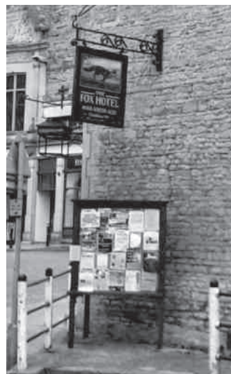
The Fox upgrade is to include a new noticeboard

The major work to refurbish and expand The Fox Hotel in Chipping Norton is well on track – and hopefully reopening date is mid-October. The News spoke to Operations Manager Bruce Benyon from Hook Norton Brewery who reports that the building has been carefully stripped out. Work now starts on 'putting it back together' with a new entrance, opened-up bar and eating areas, new relocated toilets, and ten en suite hotel bedrooms – all named with a 'hops' beer theme. At the back there will be a new atrium, landscaping and decking. Bruce promises a high quality pub-food menu all day, including evenings. They hope to have the hotel room booking service up and running by September. Outside there will be new signage and the area around the Town noticeboard, all owned by the Brewery, will be re-done. A new noticeboard will be managed and controlled by the pub to avoid it getting untidy.