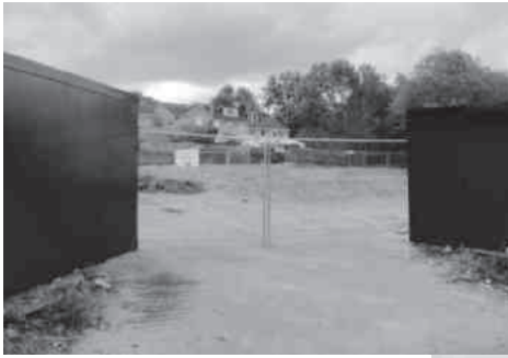
Above: The Solar site cleared and ready for nine houses

Penhurst, New Street With the massive crane swinging on the skyline, activity has been obvious on the site of the former Action for Children Home. Beechcroft Developments are building 44 homes for over 55s, including 33 two and three bedroomed houses and flats and 11 conversions of Monks Dene. Despite price tags of £350,000-£495,000, plus annual service charges, the sales team says they have sold several. Also coming is the 58 bedroomed Penhurst Gardens Care Home, offering 24 hour residential and nursing care for frail elderly residents and those with dementia. Porthaven Care Homes say marketing suites will open next spring with completion next summer.