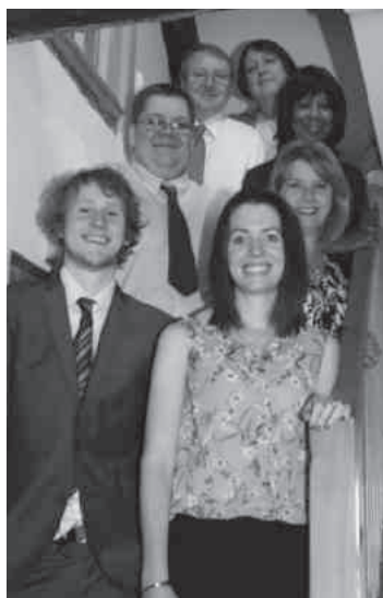
Why not join the Bradley Saul team for their 10 th Birthday Party?