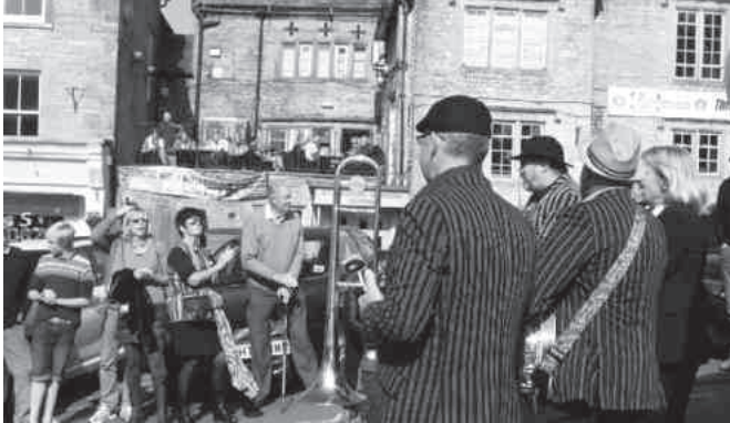
Enjoying CJAM, 2013

CJAM 2015 will this year be organized by FiddleBop ( http://fiddlebop.org ), a popular group who have been playing at the Festival for a while. When playing at our Town Festival in June, they learnt that the Jazz and Music Festival needed a new organizer, so picked up the gauntlet. This year a car park, five pubs, one hotel, a church, and two cafés will resound with mellow notes and blue notes – blown, plucked, scraped and sung during CJAM 2015. All gigs are free: programmes will be on sale throughout the Town and donations asked for throughout the day. We hope that everyone will be generous! As previously, all money raised by CJAM goes to charity. There will not be any musical events in the Town Hall but this gives other venues the opportunity to have late evening music events.