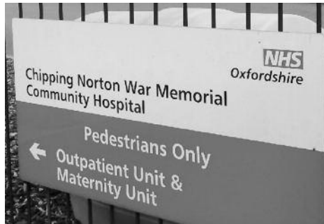
Significant signage? Above: Chipping Norton War Memorial Community Hospital, Below: OSJCT Intermediate Care Unit

The Hospital Action Group – On the NHS beds issues, HAG are organising their own meeting on Thursday 3 December 7pm in St Mary's Church, to be publicised widely, and they will be polling 12,000 local homes with a survey. They are also threatening a judicial review of the process.