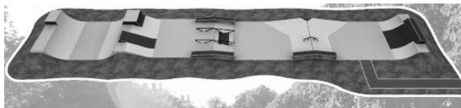
One of the possible designs for the new Skatepark

The Council intends to further develop the facilities at Greystones, with or without the skatepark, and we will use Section 106 Funds (paid by various Housing developers) that are coming to the Town in the near future. So, I hear you asking yourselves "Why is the Council hesitating?" The main reason can be summed up as "lack of belief" that there is a "real need/interest" from the Town's children and that usage will be limited. The facility may also not be looked after. Our New Street Recreation ground has been refurbished at a cost in excess of £60,000 (again from Section 106), and improvements have been very well received, but recent events show how things can be quickly ruined by a few selfish and destructive individuals. There are also worries about these areas becoming hangouts for drug users.'