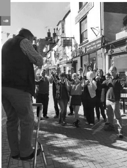
Some of the team line up in picturesque Middle Row for a publicity shot to promote the Town's bid

competition. Only three towns were shortlisted for the 'Best Market Town' category so it's Chippy against only two others. But now it is down to a public vote. Judges will be visiting soon but everyone who believes we deserve to be crowned the Best Market Town in Britain should go to chippy2win.com and vote. You can vote every day and the whole family can get involved using their different emails! And if you're active on social media, please pass the word around using the hashtag #Chippy2Win. As well as the prestige of winning, and a major chance to put the Town under the PR spotlight for the right reasons (ie not the 'Set'), the Town will get access to free advice with 100 traders in the running to receive expert tips and training from Google to bolster their digital marketing.