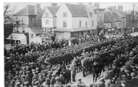
Photos of the OBLI parading in Chipping Norton

attack at Festubert and took part in the Battle of Loos together with the 6 th (Service) Battalion, who went to France in July 1915 with the 20 th (Light) Division. The 7 th (Service) Battalion and the 8 th (Service) (Pioneer) Battalion were in 26 Division and were also in France for a short period in 1915 before being sent to Salonica to assist the Serbs against the Bulgars. If this sounds like one battle after another, this is indeed how it was, leading to so much appalling injury and loss of life. It is humbling to think that 5,878 of the Regiment's soldiers gave their lives. Their memory is enshrined in the Book of Remembrance in the Regimental Chapel in Christ Church Cathedral in Oxford. Every two months on Saturdays there is a Turning of the Pages service to commemorate them and those lost in WWII.