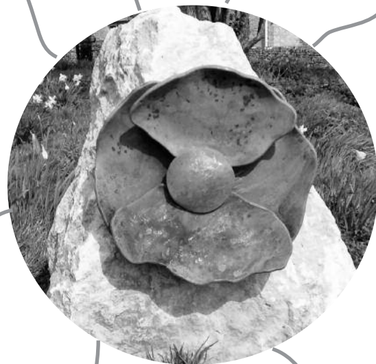
The newly-commissioned War Memorial in Salford