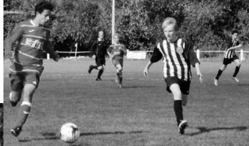
Swifts tackle the new season ~ Left: The U12s & Above: the U15s

It has been a strange start to the season for the Under 14s , who have seemed to have a different starting 11 every week