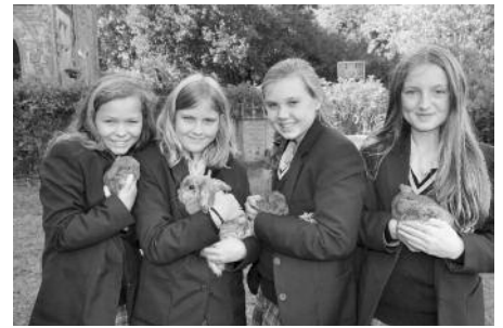
Cassie the rabbit gets top marks from new arrivals at Kingham Hill School for producing three cuddly baby bunnies

It's been a busy and productive term at Kingham Hill School so far, following on from a successful summer of A level and GCSE results. At GCSE, the total number of pupils achieving the highest marks, A*-A, has risen