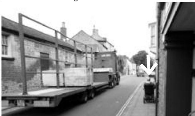
Horsefair danger: Above – a trailer takes up most of the narrow road while a mobility scooter user (arrowed) rides along the narrow pavement to be passed (lower photo) by another large truck seconds later