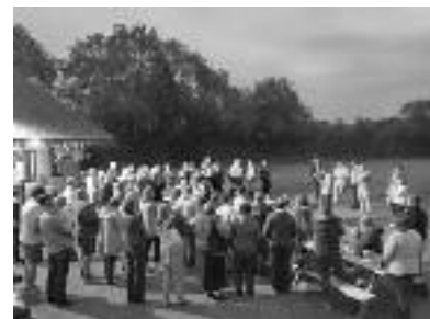
Awards Evening at the Cricket Club in September