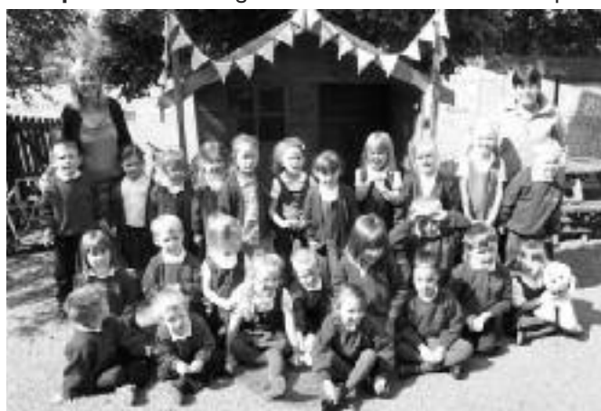
Reception Classes – above: Apple Class and below Hazel Class

Reception We are delighted to welcome our new Reception