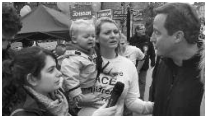
David Cameron facing 'Save the ACE Centre' campaigners back in 2013

Oxfordshire County Council has aroused campaigners again – after a major furore in 2013/4 – with new proposals to cut services and close most local children's centres across the County. With more budget constraints and reduced funding from central government, the County say they are forced to cut £8m from the current £16m used for children's centres